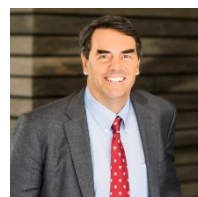
Tim Draper Founder Draper Associates